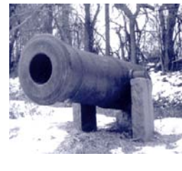
This cannon is a Civil War siege cannon. Its line of sight marks the old cart road known as Sandy Hollow.

The first line of Colonial defense formed along Renwick Run to the Meeting House and east. This line broke in confusion under heavy fire to reform from "Skirmish Hill" to high ground on the east in a wavering but often amazingly courageous defense. Five times the Colonials lost and regained their position under heavy fire.