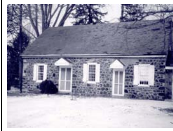
The Birmingham Meeting House served as a hospital for both British and American wounded.

To the east of this point is the "Federal House" and directly to its east are the remains of the stone building (1750) that looked down upon the battle field.